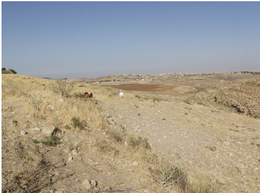
Fig. 1. Wheat fields in Hisban today. The well-watered Madaba Plains were one of the bread-baskets of Mamluk-period Jordan and an important revenue base for the state.

transport from threshing floors to granaries ( shuwan ) must have been done overland, on the extensive road system developed in the early Mamluk period. The granaries took two forms: formally built shunas , which is a common enough place name in the Jordan Valley, and reused cisterns, which are ubiquitous in the country's soft limestone beds and can preserve grains for up to two years 12 . Both facilities required regular maintenance through cleaning and plastering. Because of Jordan's special hydrological conditions and infrastructure, its grain industry was highly vulnerable to drought and the security of the road system. As for cropping patterns, the fallāḥūn of Jordan traditionally practiced a two-crop rotation on most cultivated land, including the Jordan Valley. Land tenure, in those areas not assigned as iqṭā'āt , may have been communal, with a division of revenues among villagers after the harvest according to shares, known today as musha' and very similar to the pattern of shares adopted by the muqta's 13 .