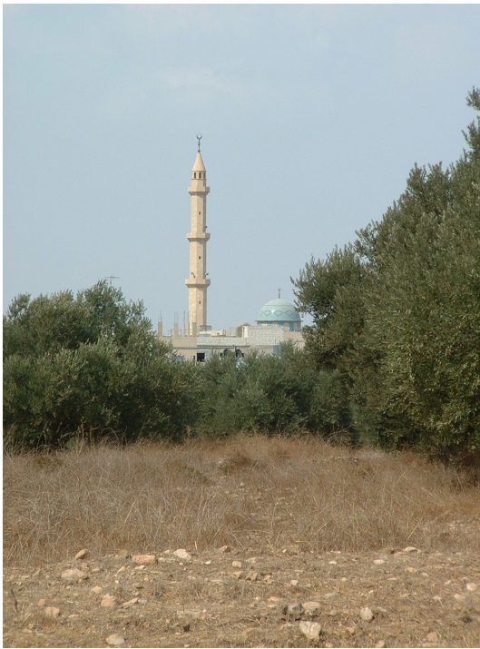
Fig. 3 – Olive groves in the village of Malka, near the olive processing plant identified during survey in 2003.

Folia 18-21 of this 2.5 meter-long scroll describe the village of “Hay Malka” at the end of the century and document in some detail the dimensions of the medieval village, the