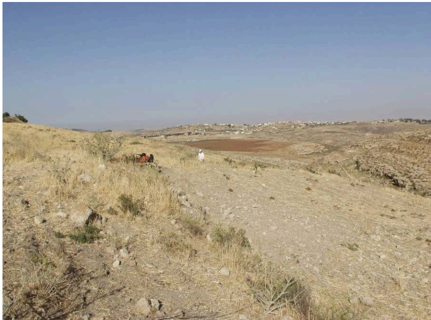
Fig. 1. Wheat fields in Hisban today. The well-watered Madaba Plains were one of the bread-baskets of Mamluk-period Jordan and an important revenue base for the state.

transport from threshing floors to granaries ( shuwan ) must have been done overland, on the extensive road system developed in the early Mamluk period. The granaries took two forms: formally built shunas , which is a common enough place name in the Jordan Valley, and reused cisterns, which are ubiquitous in the country's soft limestone beds and can preserve grains for up to two years 12 . Both facilities required regular maintenance through cleaning and plastering. Because of Jordan's special hydrological conditions and infrastructure, its grain industry was highly vulnerable to drought and the security of the road system. As for cropping patterns, the fallāḥūn of Jordan traditionally practiced a two-crop rotation on most cultivated land, including the Jordan Valley. Land tenure, in those areas not assigned as iqṭā'āt , may have been communal, with a division of revenues among villagers after the harvest according to shares, known today as musha' and very similar to the pattern of shares adopted by the muqta's 13 .