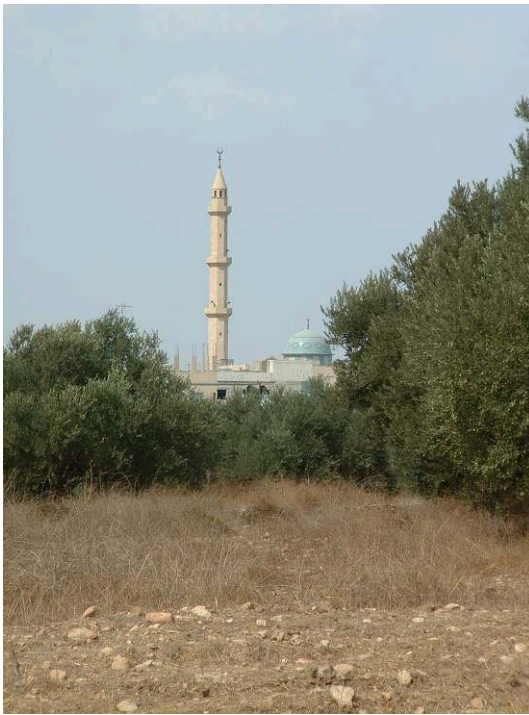
Fig. 3 – Olive groves in the village of Malka, near the olive processing plant identified during survey in 2003.

Folia 18-21 of this 2.5 meter-long scroll describe the village of “Hay Malka” at the end of the century and document in some detail the dimensions of the medieval village, the